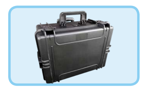
Protective Hard Case