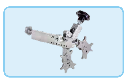
3 Way Adapter