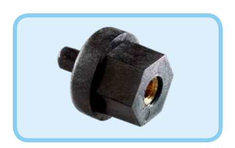
Nylon Power Drive Adapter