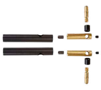
MK4 4.0mm, 4.7mm Ø 90° Connectors